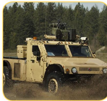
Unmanned Vehicle Control

The VG440 combines highly-reliable MEMS gyros and accelerometers with high-speed DSP electronics to provide a fully stabilized vertical gyroscope in a small and rugged environmentally-sealed enclosure. The VG440 provides consistent performance in challenging operating environments and is user-configurable for a wide variety of applications